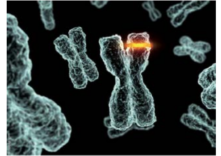
Master of Science in Molecular Life Sciences (MSc MLS)

Particular focus is placed on practical work throughout the Master's programme, consisting of: