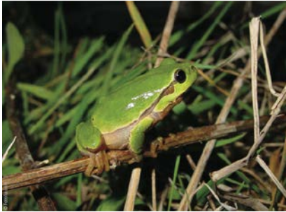
Master of Science in Behaviour, Evolution and Conservation (MSc BEC)

The qualifications awarded for the three Masters' programmes are as follows: